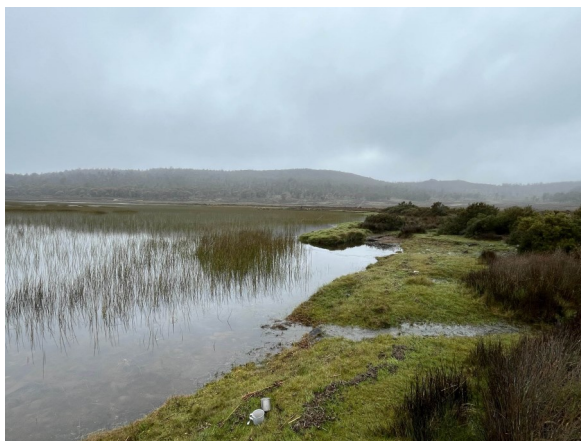
A productive edge along Lake Fergus

Thanks to Randall for continued access and also to the members who attended. Cheers Graeme.